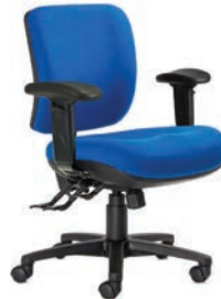
with optional adjustable arms