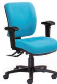
with optional adjustable arms.