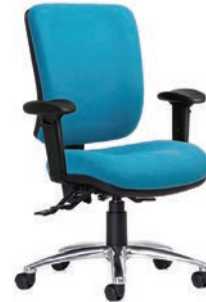
with optional alloy star-base and arms.