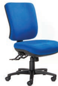
REX PLUS HIGH-BACK