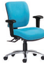
with optional alloy star-base and arms.